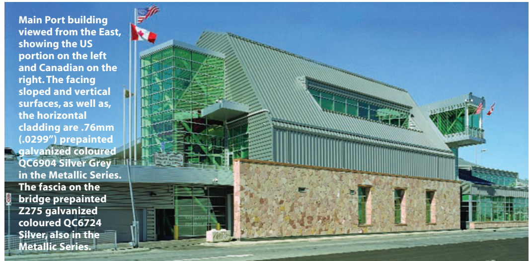
Main Port building viewed from the East, showing the US portion on the left and Canadian on the right. The facing sloped and vertical surfaces, as well as, the horizontal cladding are .76mm (.0299") prepainted galvanized coloured QC6904 Silver Grey in the Metallic Series. The fascia on the bridge prepainted Z275 galvanized coloured QC6724 Silver, also in the Metallic Series.

(Reprinted with permission from ArcelorMittal Dofasco Steel Design, 2008)