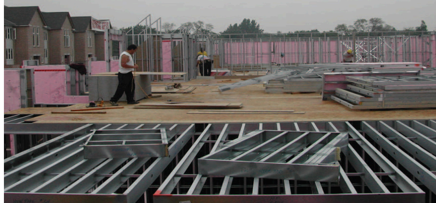
Hyde Park Condominiums (Zentil): Genesis™ steel panels and roof trusses made from light steel framing contribute significantly to meeting several of the prime building considerations - quality, lightweight and speed of erection.

KML's Mifsud echoes those sentiments: "Whether your project is a nursing home, senior's residence, long-term care facility - all with an increasing demand for new beds - or whether you're in residential construction wanting to close homes sooner and collect earlier, pre-assembled Genesis systems speed up construction, reduce costs through direct and indirect costs like on-site waste and eliminate framing-related callbacks. That all adds up to value that any client we've ever met wants. And of course, the entire system is built around light steel framing, which has quality advantages over alternate building materials."