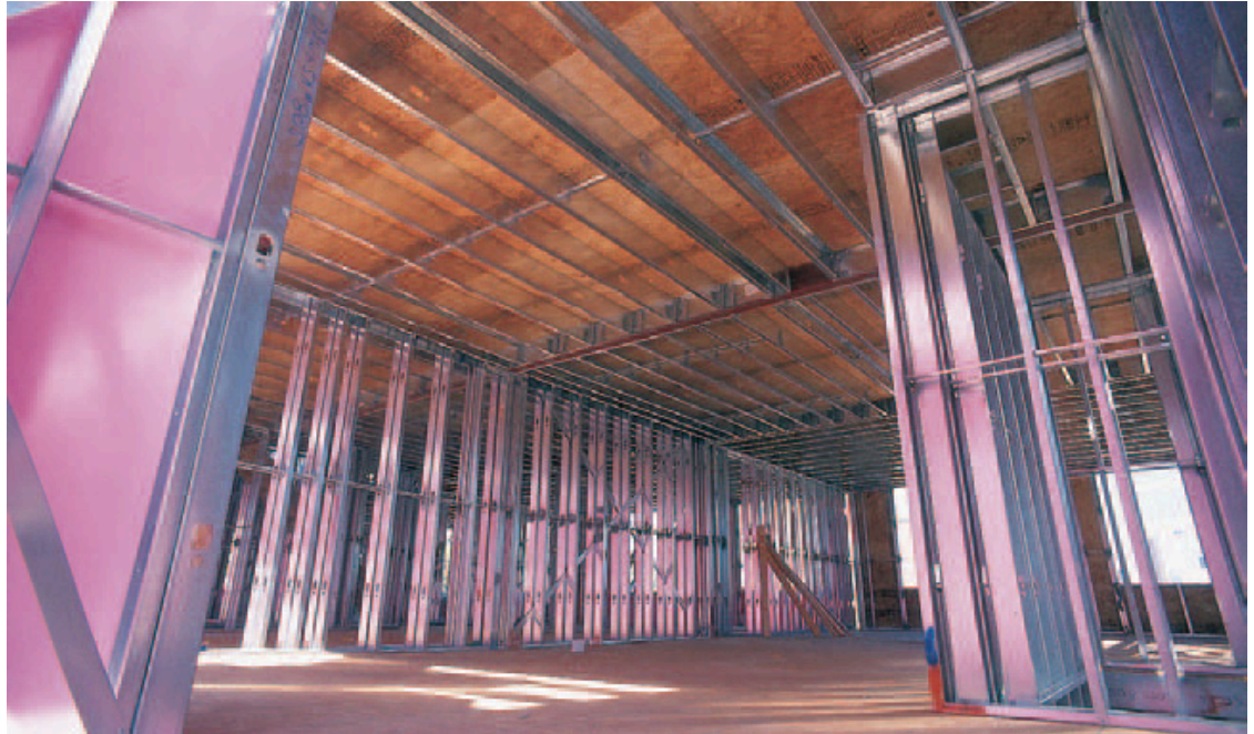
King West Village (Urbancorp): Extensive use of light steel framing, both structural LSF sections and non-loadbearing, was a feature of this four-storey project.

Some improvements in residential and commercial construction are mainly cosmetic, some enjoy more substance. Whether visible or not they add value to a project. Value is, of course, in the eye of the beholder. People will differ on what constitutes aesthetic improvements. But what no one argues about is that if you can improve the performance of a structure and save money at the same time, you have indeed created value.